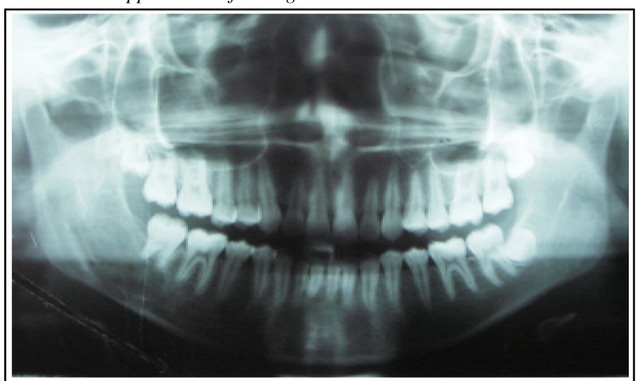
Figure 1: The orthopanthomogram (OPG) showed a soap bubble appearance of the right mandible.

A 15 year old Malay girl from Ipoh, Perak who experienced persistent severe bleeding from the lower right gum was referred to our hospital. Her problem started when she was seven years old whos, she experienced bleeding from the lower right first premolar tooth. The bleeding was minimal but recurred which prompted her parents to bring her to a private dental clinic in Ipoh several times. The bleeding was about 4 to 5 times per year. Unfortunately had the bleeding got worse and never