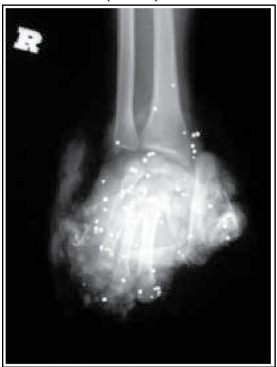
Figure 2: Severe right hand injury with multiple shrapnel in-situ

complex and time consuming during the initial management at emergency department since it involves various surgical disciplines and extensive radiographic imaging. We describe 2 cases of bomb blast injury that occurred at an army camp in September 2000. The purpose of these reported cases is to illustrate the clinical presentations of hand grenade blast injury and the possible outcomes.