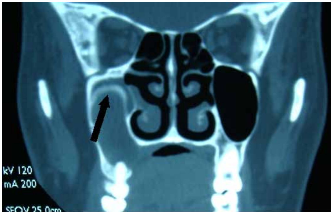
Figure 1: CT scan picture illustrating a cystic mass displacing the floor of maxillary sinus (arrow) giving a double wall appearance

walls and exhibiting a double wall appearance superiorly (Figure 1). The mass was arising from the alveolar process of the left maxilla without the presence of the impacted tooth within. Based on the patient's history, physical examination and CT scan findings, we concluded that she had a benign jaw cyst. Excision of the cyst was planned and intraoperatively under general anaesthesia, a sublabial incision was employed after local anaesthesia was administered at the upper left gingivobuccal sulcus. Initially, enucleation was performed under direct visualisation, but as the cyst extended superiorly, pushing the floor of the maxillary sinus until it approached the roof of the maxillary sinus, further enucleation was hampered by poor visibility and illumination. From this point onward, enucleation was carried out with the assistance of a rigid (0-degree) endoscope, which was held with the most dominant hand while the other hand performed the enucleation. The cyst was noted to have been attached firmly to the root of the erupted left upper canine, which was subsequently extracted. The patient's postoperative period was uneventful, and she was discharged on the second postoperative day. Postoperative histopathological examination reported the mass as a radicular cyst.