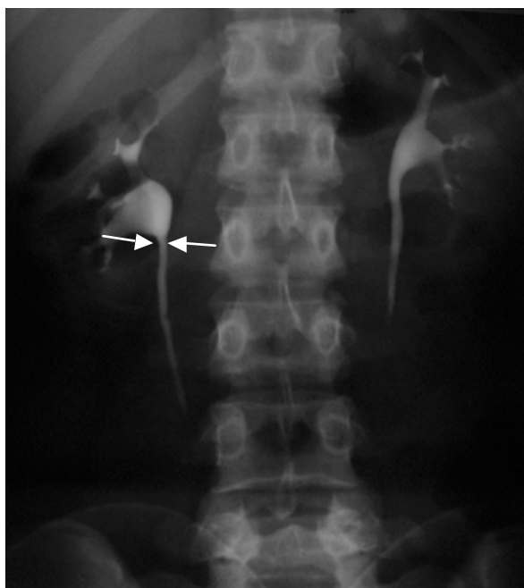
Figure 1: Right abdominal ureter measurement (arrows)