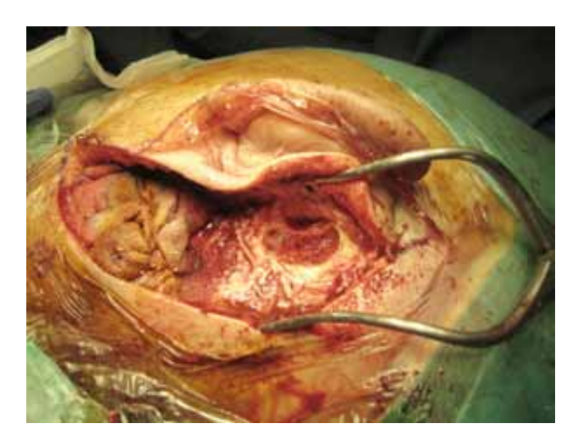
Figure 3: Cortical mastoidectomy performed concomitantly with fasciotomy.

the infection progressed to involve the larynx and mediastinum. Subsequently, she developed septicaemic multi-organ dysfunction. Family members were consulted regarding her poor prognosis, and they requested to bring her home. She then expired at home a few days later.