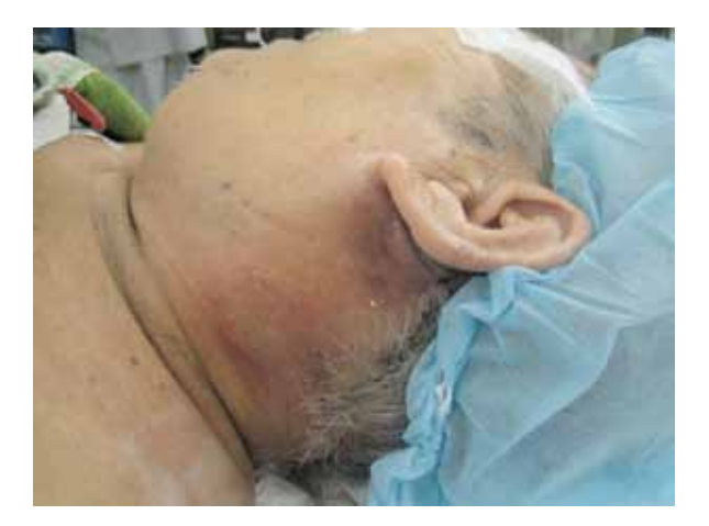
Figure 1: Necrotizing fasciitis involving the neck with post-auricular inflammation secondary to acute mastoiditis.

A 70-year-old Chinese female presented with a three-day history of painful left facial and neck swelling associated with odynophagia. She had a recent hospital admission for uncontrolled diabetes mellitus. Examination revealed a dehydrated patient with an inflamed left hemifacial region extending to the submandibular region and crossing the midline. She also had trismus. Intraoral examination revealed a left buccal ulcer and dental carries affecting the left lower canine and premolars. Ultrasonography of the neck showed an ill-defined hypoechoic collection with