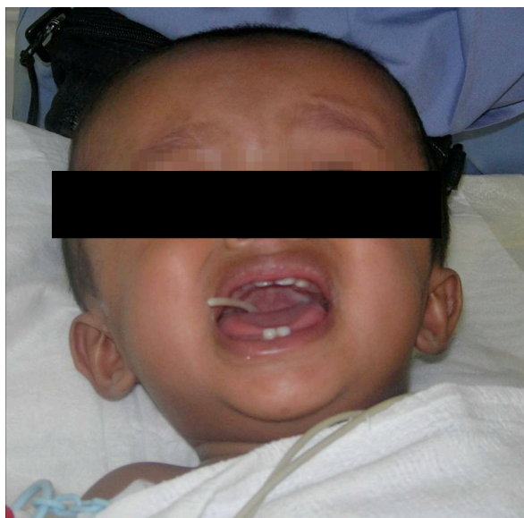
Figure 1: Ventriculoperitoneal shunt tip protruding periorally