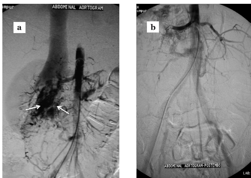
Figure 3: (a) Abdominal aortogram shows tumour blush (white arrows) at the inferior vena cava. (b) Post-embolisation abdominal aortogram shows complete absence of the tumour blush.