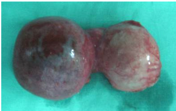
Figure 2: Dumbbell-shaped gastric duplication cyst.