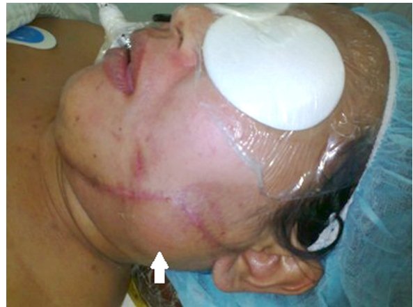
Figure 1: Photograph of the patient showing a laceration scar across the left cheek extending from the left ear to the mandible with a large swelling on the parotid region (white arrow).

A technique of peroral catheter drainage has been previously described, and almost all the authors reported excellent results in their patients (4–7). Demetriades reported the largest series to date, and showed a success rate of 92% in 12 cases (7). In his technique, a small skin incision is made at the facial scar over the sialocoele, through which a small forceps is used to enter the cyst and puncture into the oral cavity. Using the forceps, a catheter is then introduced into the cyst via the oral cavity and secured to the oral mucosa, and the skin incision is closed with a single suture. We used a sinuscopy trocar cannula to puncture the sialocoele from within the oral cavity, which we considered safe for a large palpable cyst like that in the present case. This spared us from an external approach via a skin incision, as sometimes a thick scar and fibrotic tissue may complicate the access into the cyst. Insertion of the drain can be done via the trocar cannula, which is simple and efficient. The drain is anchored in such a way as to allow for better fitting to the buccal mucosa, while at the