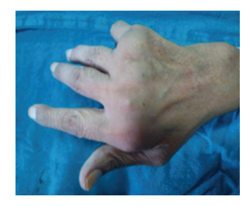
Figure 1: Swelling and deformity of metacarpophalangel joints of right hand.