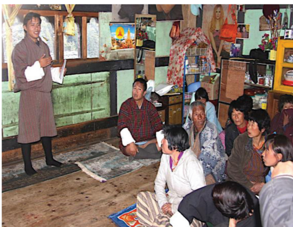
Figure 3a. Community Mobilisation. An indigent villager had been identified in the previous analysis phase. This student mobilised the community to address her needs.

A common problem, reminiscent of university courses, is the so-called 'silo' effect, whereby subject material (with a Table of Contents arrangement) dictates the training course material. It is essential to focus on what