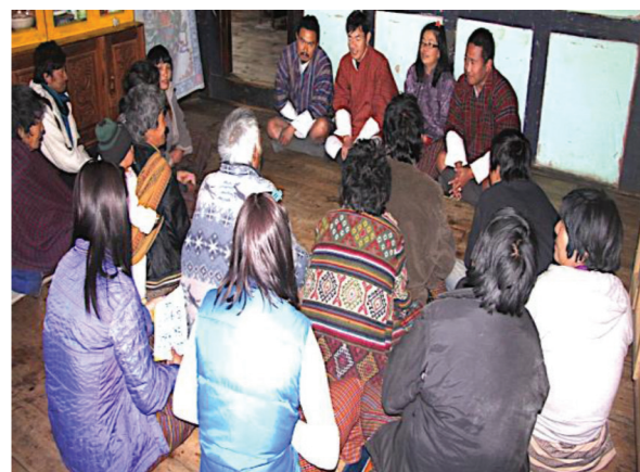
Figure 3b. Committee Formation. The committee that resulted from these efforts arrange for her room renovation, monitoring, acquiring supplies, and setting up a bank account to handle the finances.