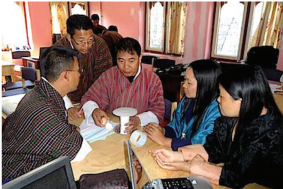
Figure 2a. BPH students work in teams on the management of group dynamics and communication. The aim of the exercise was to construct (with the same materials provided) a device that would ensure that a raw egg survived a drop of 1 storey.

those methods with some authority. Curriculum design should be allocated to those with experience, especially in developing training programmes; with subject experts providing their contribution.