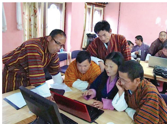
Figure 1. BPH students work primarily in small groups in class at RIHS.

These student-centred approaches (8–9) include problem-based learning (10) (Figure 1), team-based learning (11) (Figure 2a,b), service learning (12). These approaches which hand over more control to the students, in our experience, fail miserably in university settings, even though some initiatives are made; over time, academic courses will revert to the familiar. Lecturers are especially afraid of being challenged by students, so interactive or participatory approaches rarely happen. If there is hope, it remains with international agencies and ministries that organise training courses.