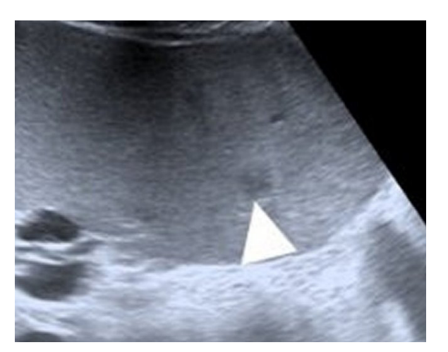
Figure 1. Splenic nodule with hypoechoic center and hyperechoic peripheral zone forming a target sign appearance observed upon the ultrasonographic evaluation of a 26-year-old woman with type-1 Gaucher's disease