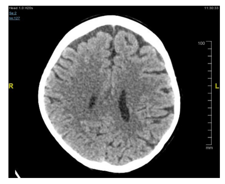
Figure 2. CT scan shows bilateral frontal brain atrophy